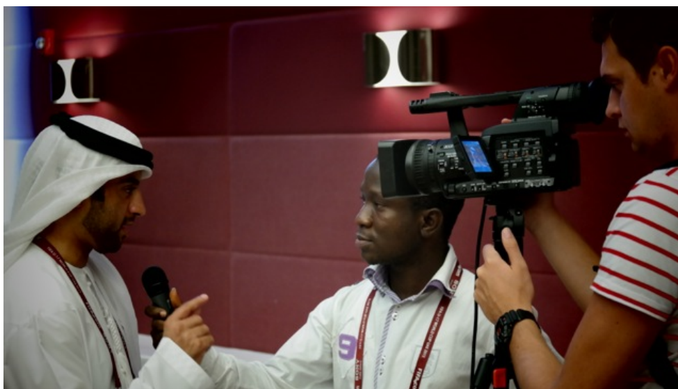
AIPS Young Reporters conduct a television interview at the U17 FIFA World Cup in Dubai.

Candidates will be between the ages of 19 and 25 already working in the media. Recent university graduates working as interns or in similar training roles in established news organizations will also be considered. Applicants must be proficient in writing and presenting news reports in English. AIPS will publish news items in the participants' mother tongue as well as in English.